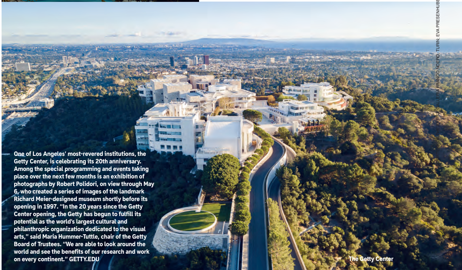
The Getty Center