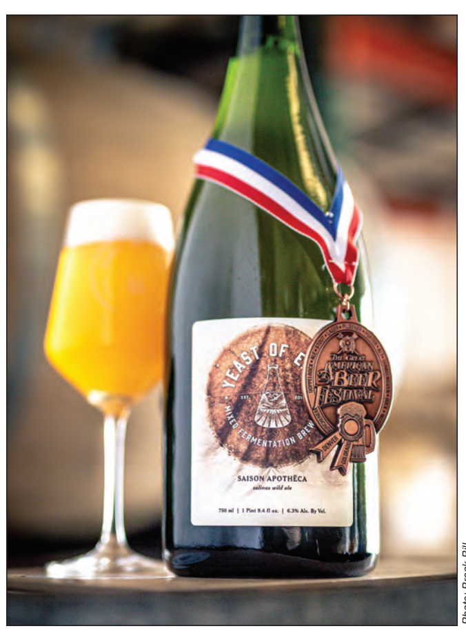
Carmel's Yeast of Eden won a 2019 Great American Beer Festival bronze medal in the Belgian-style sour category.

Champagne Hopi took first in the specialty IPA category. Peter B's Brewpub, another Monterey venue, won gold in the competition's standard British ales category with its English-style brown ale, Inclusion Amber.